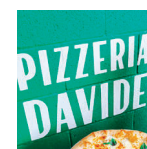
Pizzeria Davide Strip District