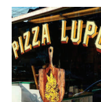
Pizza Lupo Lawrenceville