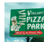
Vincent's Pizza Park Forest Hills