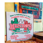
Mineo's Pizza House Squirrel Hill & Hampton