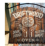
Driftwood Oven Lawrenceville