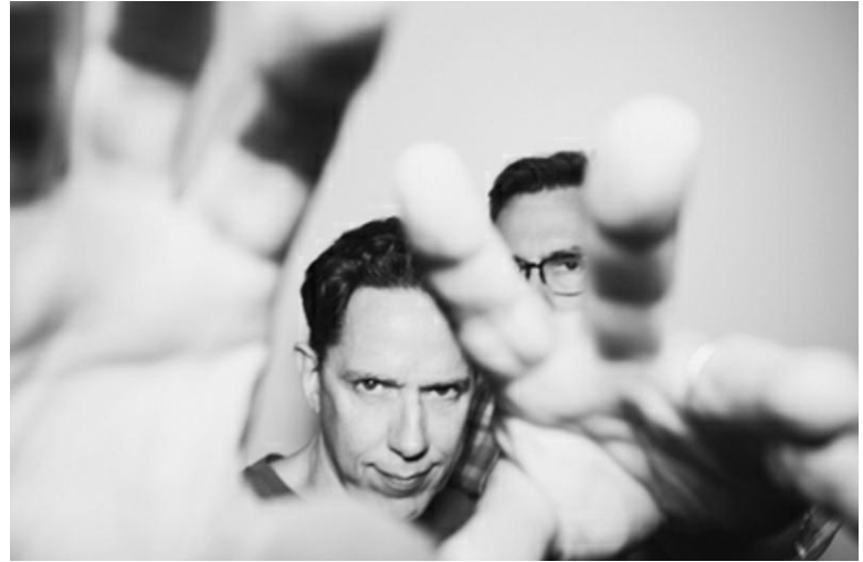
Rock duo They Might Be Giants.