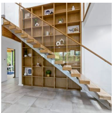
A set of shelves behind the stairs.

change was just an idealistic dream we had," mused Witt.