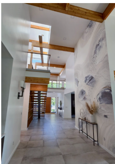
The front hall of 409 Fox Chapel Road in Fox Chapel.

"Being in that great room and looking out and seeing the seasons